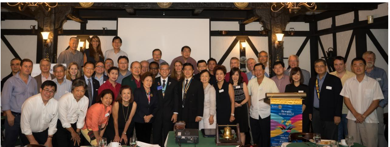
Big attendance from members & guests from RC Queenstown for DG first official visit