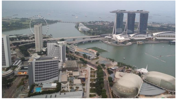
Beautiful panoramic view of Singapore