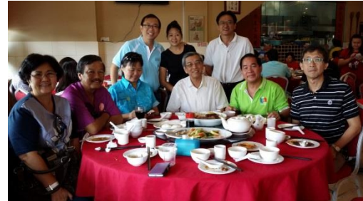
Sumptuous lunch at “Hai Thain Loh “ sea food restaurant