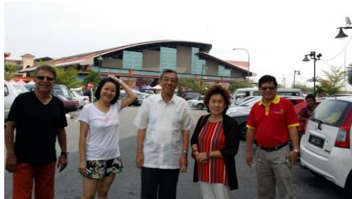
Arrived at the new market place