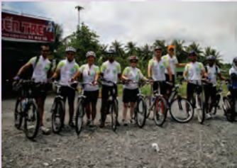
The team at the start of the journey in the town of My Tho, Vietnam.

The RCBT carefully mapped out the fund raising strategy. In addition to pledges and grants, there was a launching of the documentary which was sponsored by the Australian High Commission. The screening of the documentary raised S$10,000.00 from donations and carpet sales and auctions. In all, we raised a total of more than S$42,000.00 from this project. (Note – this will be an ongoing project for RCBT over the remainder of 2011-12 and in the coming Rotary year 2012-13.)