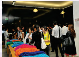
Viewing the carpets on sale