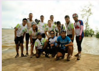
The team covered in mud but still all smiles after a challenging day