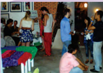
Cambodia documentary launch, Siem Reap 30/3/12