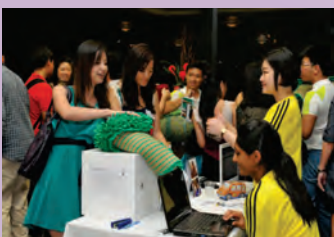
Frantic buying of carpets after the screening.