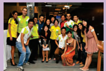
Most of the Gone Cyclin' crew and friends after the event