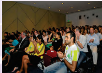
A Full House - standing room only at the screening.