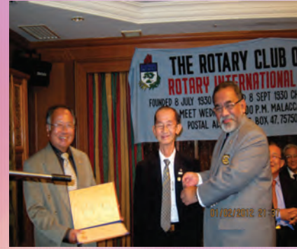
Presenting Paul Harris medallion and Certificate.