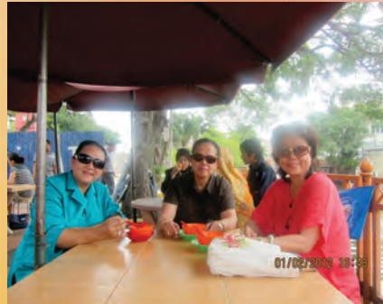
...enjoying the best cendol in town.