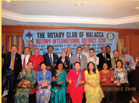
One for the album...till we meet again.