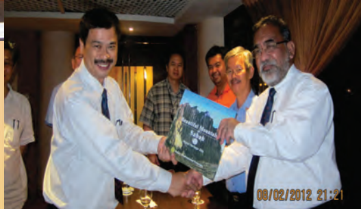
A gift to the President.