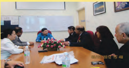
Courtesy call to the Director of Miri General Hospital.