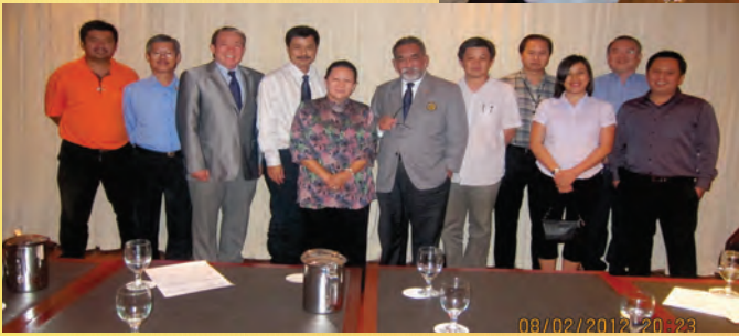
Everything looking serious again ...