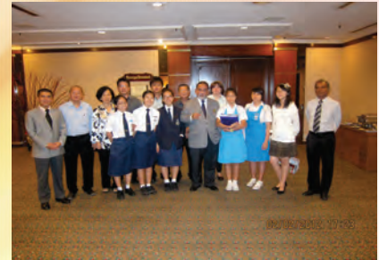
One for the album.