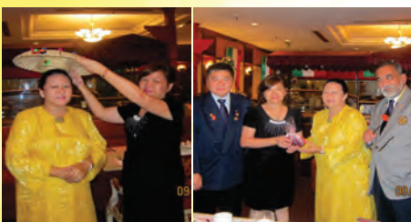
Exchange of gifts.