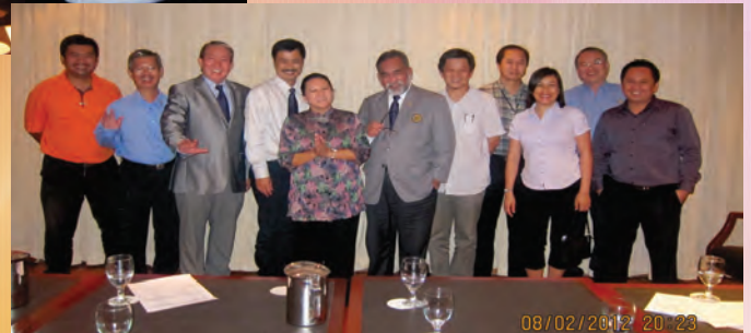
But all's well that ends well!