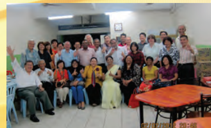
Thank you for everything!