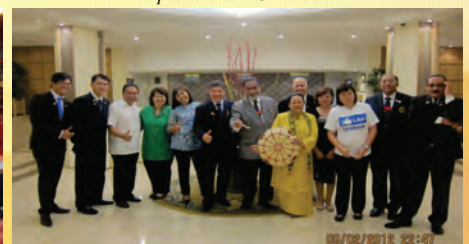
Goodbye till we meet again..Thank you.