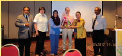
Exchanging of gifts.