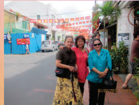
Tour of beautiful Malacca.