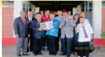
Presentation of gifts.