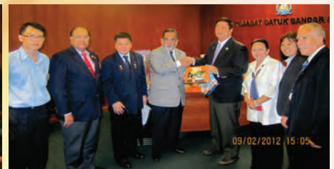
Exchanging of gifts.