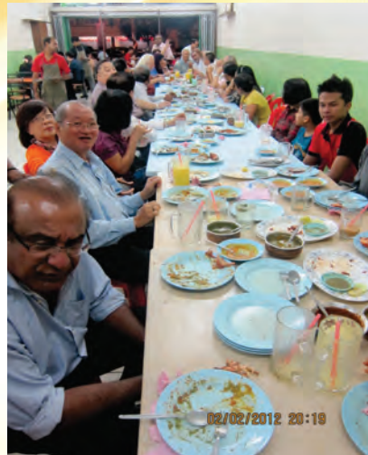
Great food and great fellowship!