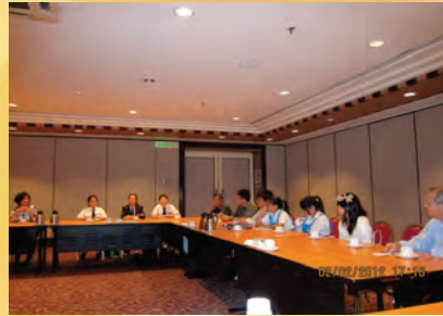
Meeting with Interactors.