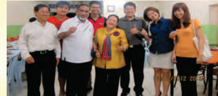
One for the album with Rotaractors.