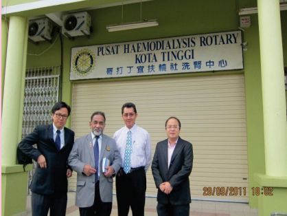
At the Kota Tinggi Haemodialysis Centre.