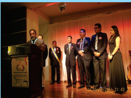
Induction of new member.