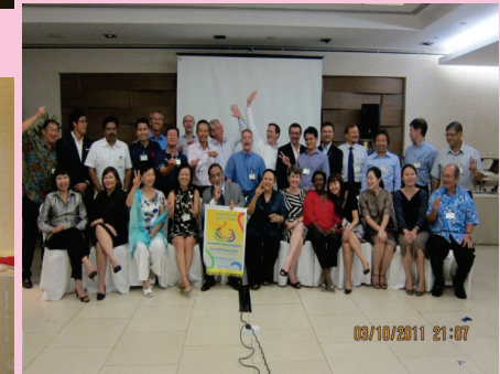
A very vibrant group!