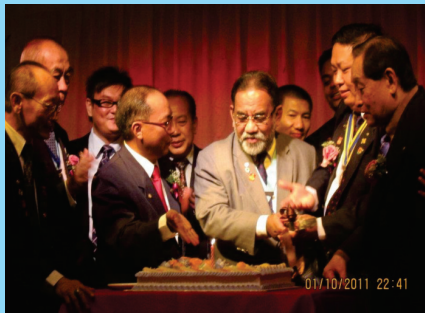
Cutting of anniversary cake.