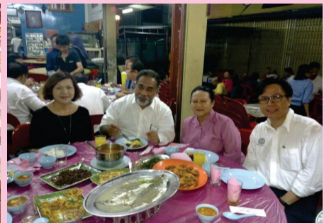
After a hard day's work, a sumptuous meal and excellent fellowship.