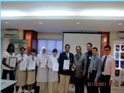
Presentation of certificates to Interactors.