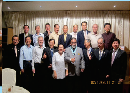
One for the album.