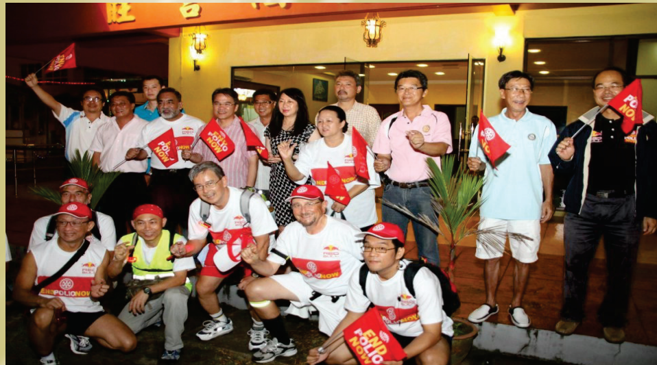
Our intrepid Rotarians just before they were flagged-off on their historic journey.

As a Sabahan, I would like to think that this “Walk for Life” journey to rid the world of all the pain and suffering that had crippled countless children for countless generations will finally bring a closure to the people of Sabah. The tragedies and ghosts of war can perhaps be finally expiated by this group of selfless Rotarians. I look forward to making a full report of this amazing journey in the next issue of Rotary Voices.