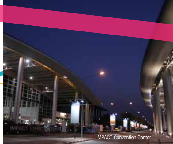
IMPACT Convention Center

The Impact Center, one of Asia's largest convention centers, will be the main site for all plenary sessions, the House of Friendship, booth exhibits, and most RI-related official meetings. Located approximately 30 minutes from Bangkok's city center, the convention center offers modern amenities such as the Royal Jubilee Ballroom, where special luncheon events will be held.