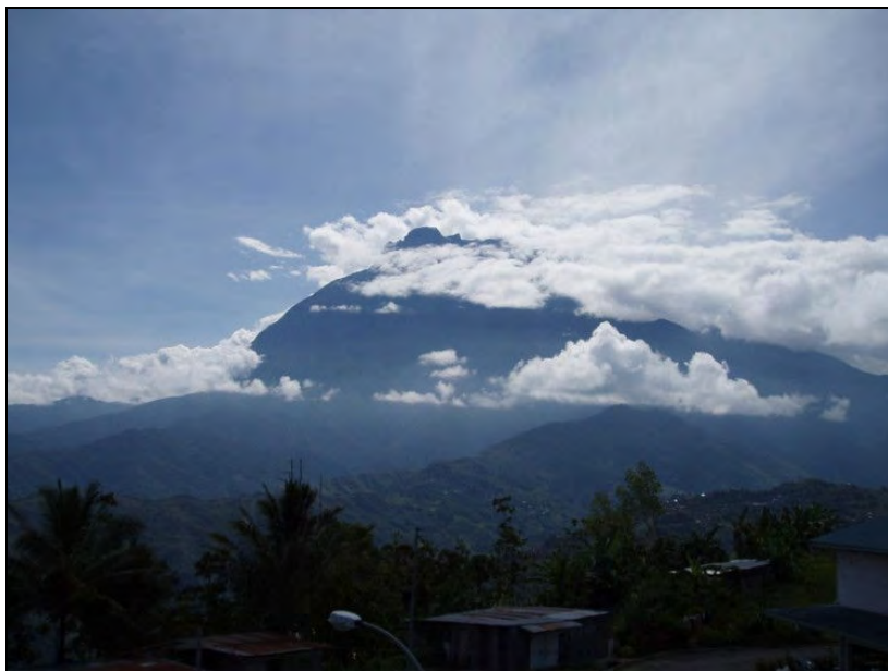
Mount Kinabalu (4095m).