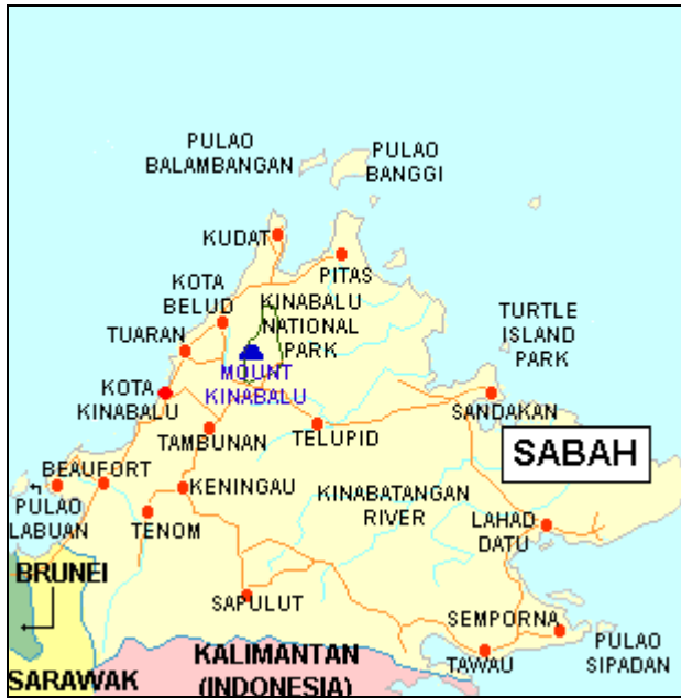
Map of Sabah, part of the island of Borneo.