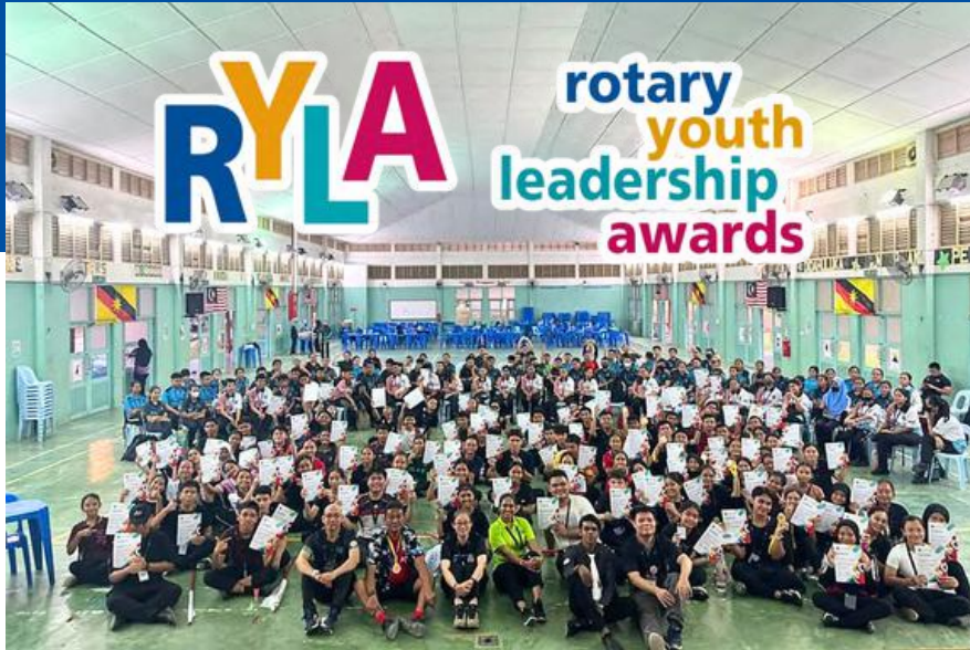
Photo from RYLA in SMK Kapit

Rotary believes in developing the next generation of leaders. Our programs help younger leaders build leadership skills, expand education and learn the value of service.