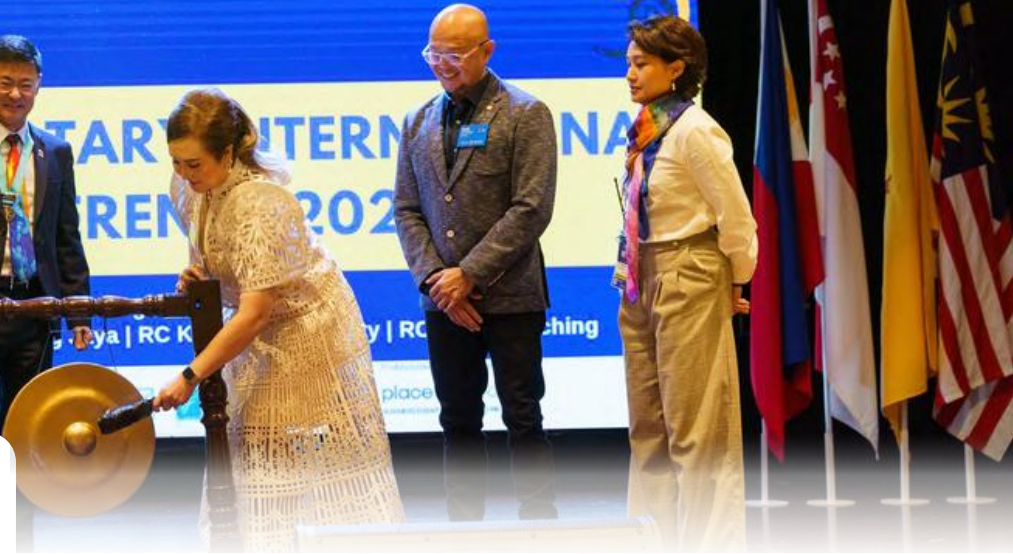
Host Club: Rotary Club of Kuching Together With:

33 RD DISCON ROTARY INTERNATIONAL DISTRICT 3310 CONFERENCE 2024